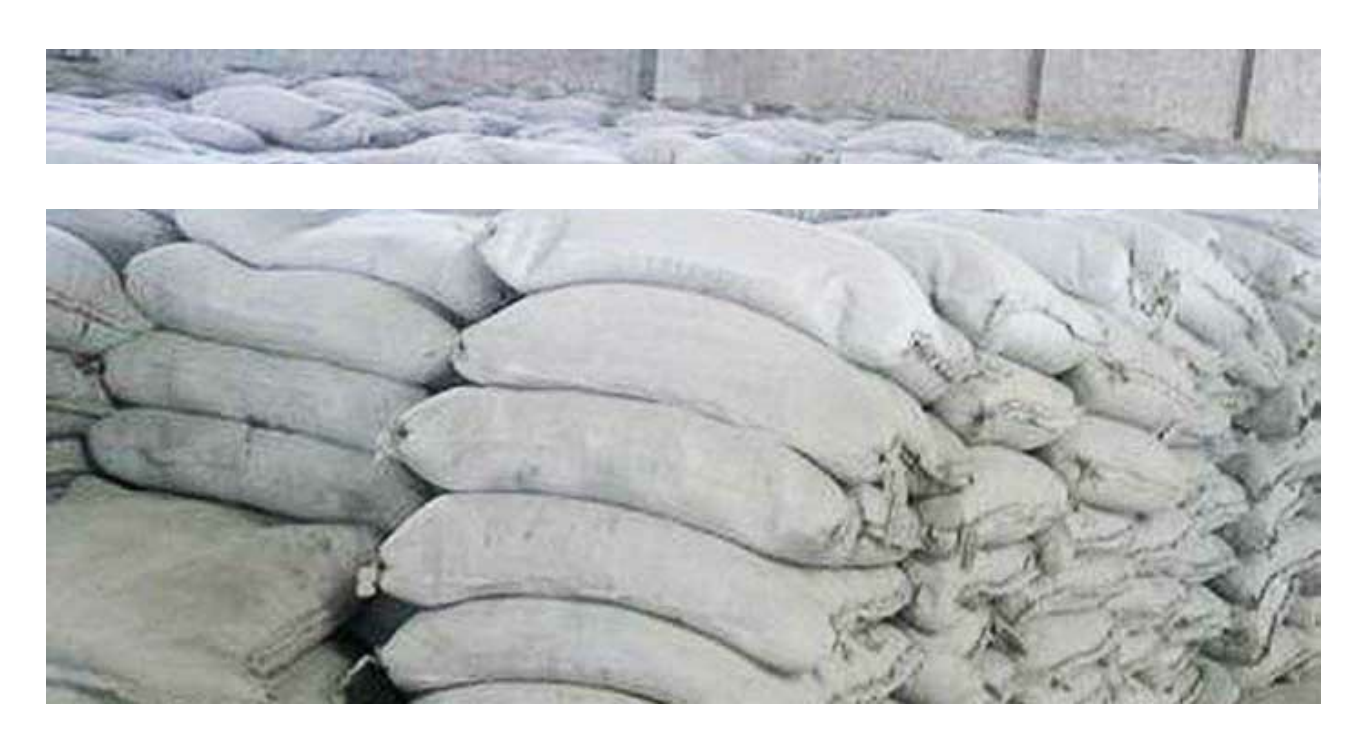
18 Common Types of Cement [Properties & Use]